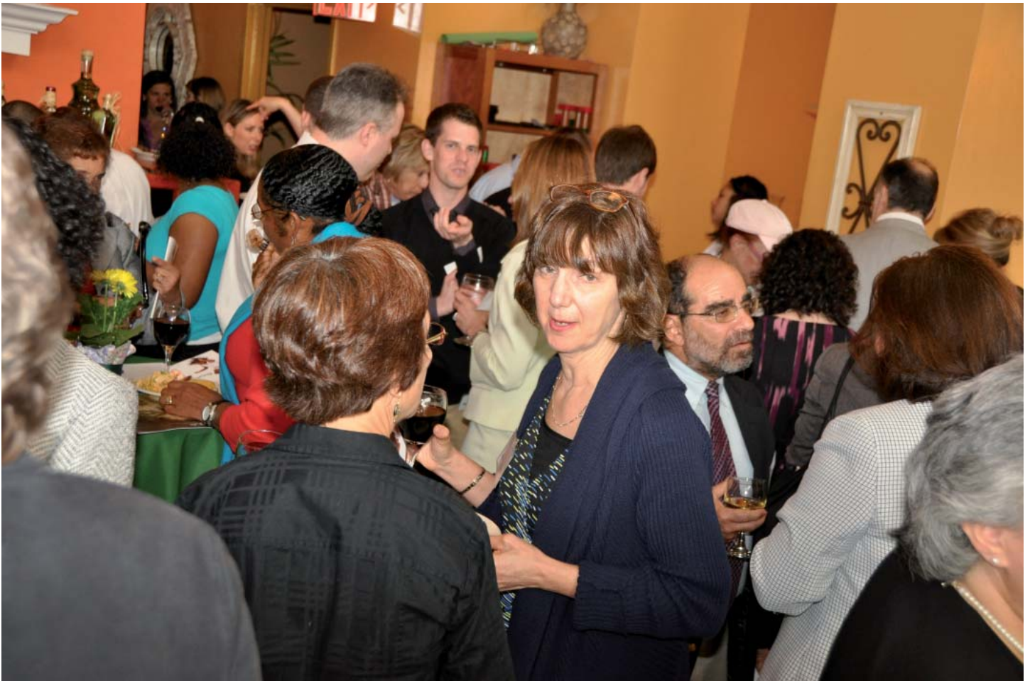
Nearly 200 people enjoyed the great food and wine, silent auction and moving presentations.